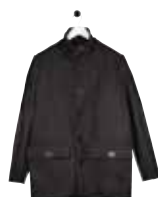
Saint Germain jacket