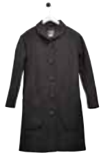
Saint Germain coat