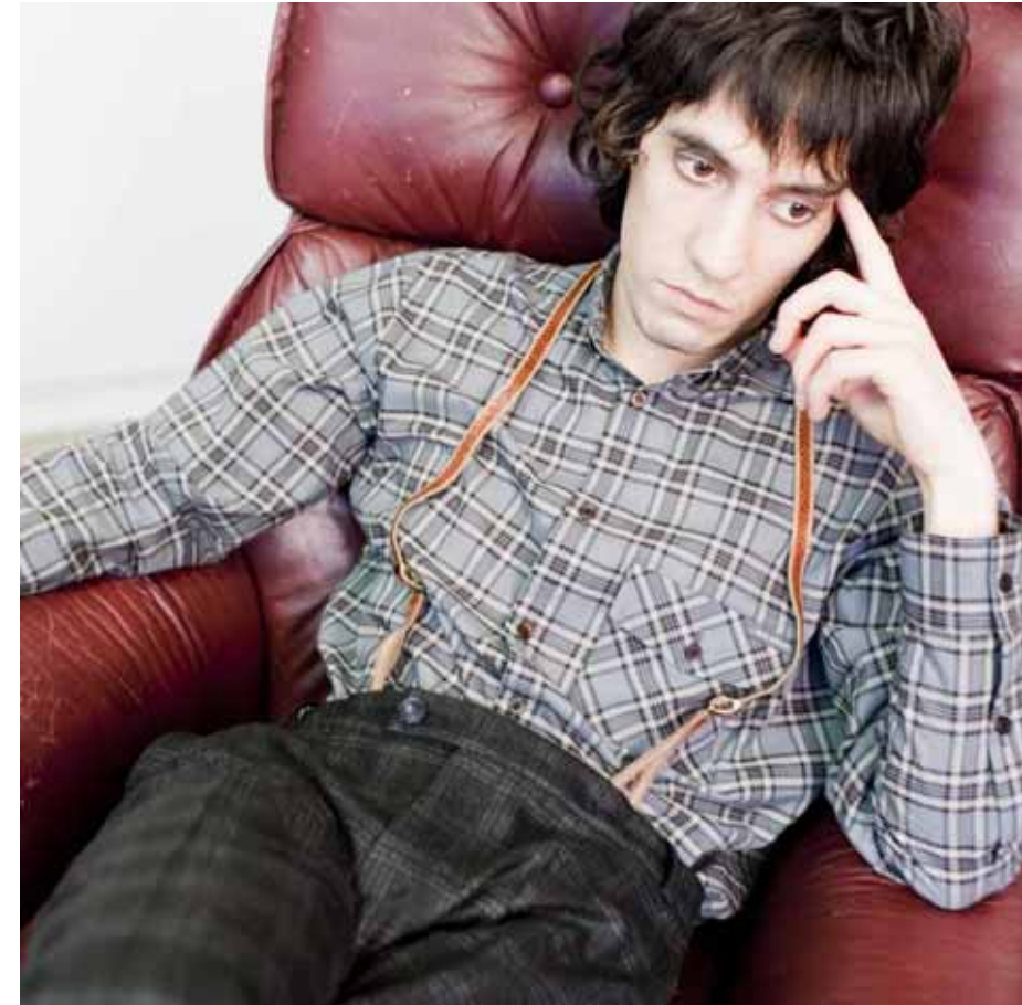
Shirt Björkhagen trousers Gubbängen